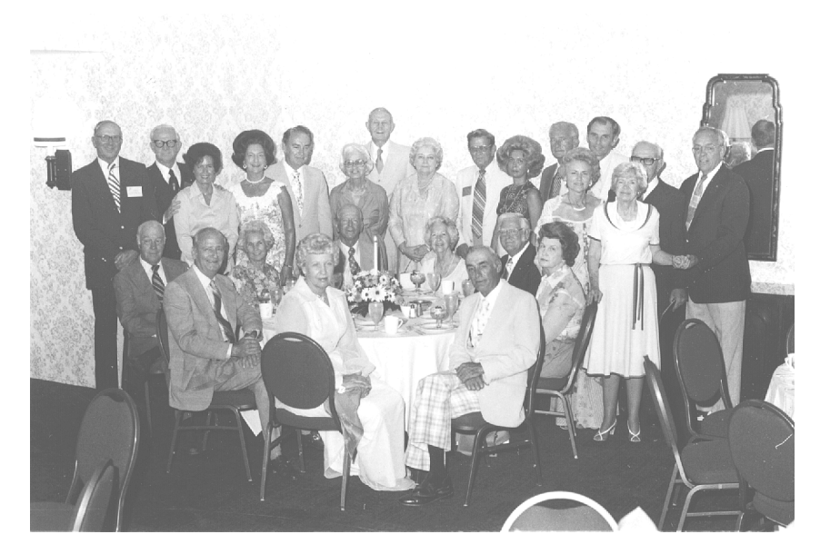
The SNA Past Presidents' Club Dinner The Atlanta Marriott, Motor Hotel, Atlanta, GA August, 1974