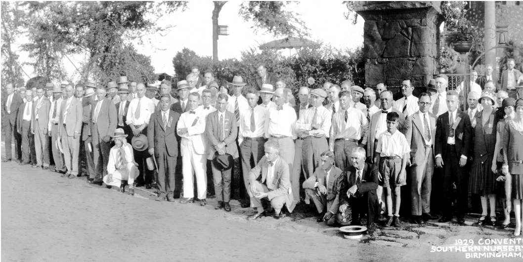
SNA Convention Birmingham, AL 1929