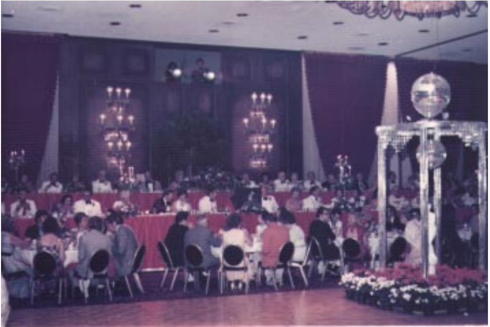
SNA Past Presidents' Awards Banquet - Atlanta Marriott Motor Hotel, Atlanta, GA - August 4, 1974