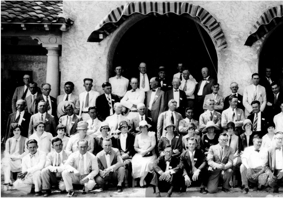
SNA Convention Jacksonville Beach, FL 1933