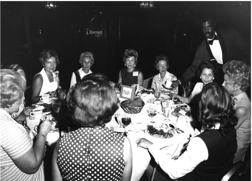
SNA First Lady's Luncheon, Atlanta Marriott Motor Hotel, Atlanta, GA - 1973