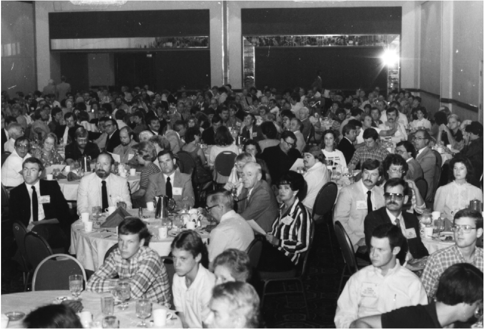
Annual SNA Business Breakfast, Atlanta Hilton & Towers, Atlanta, GA, August 1984