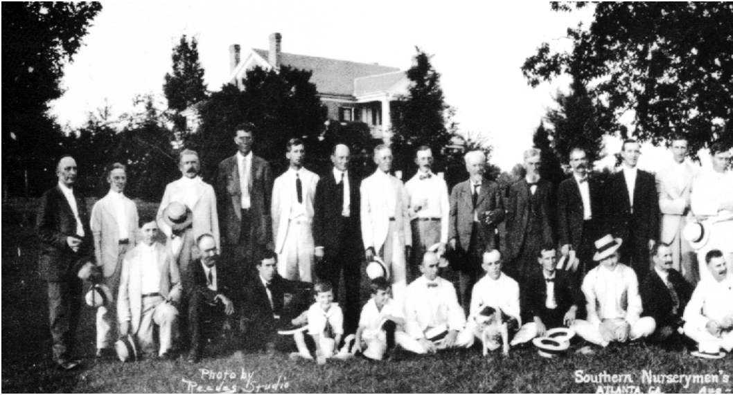
SNA Convention Atlanta, GA 1916