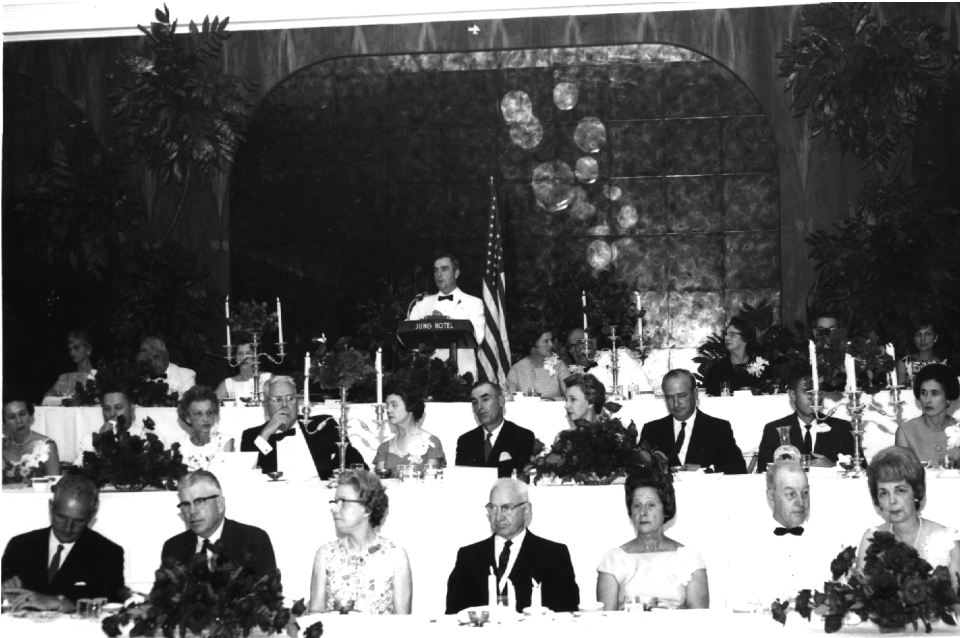
SNA Past Presidents' Awards Banquet - Jung Hotel, New Orleans, LA - August 8, 1966