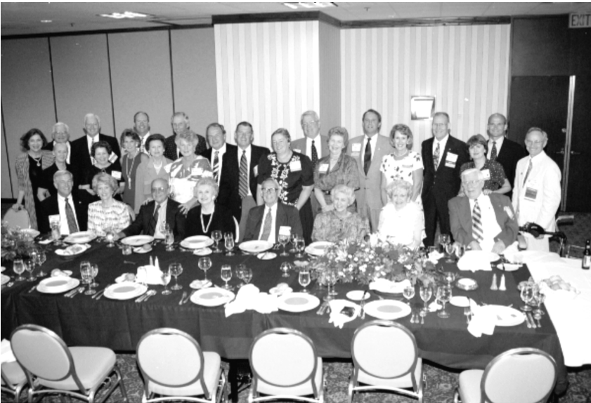
The SNA Past Presidents' Club Dinner The Atlanta Marriott Marquis, Atlanta, GA August, 1998