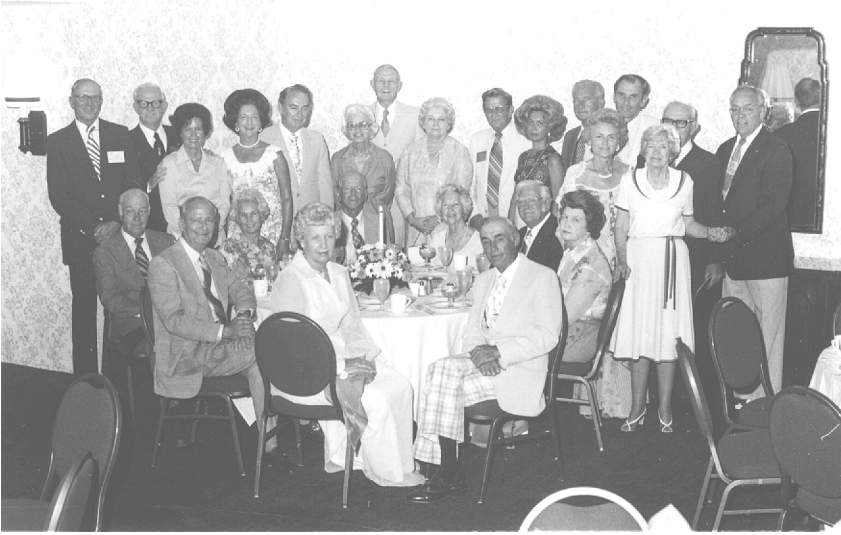
The SNA Past Presidents' Club Dinner The Atlanta Marriott, Motor Hotel, Atlanta, GA August, 1974